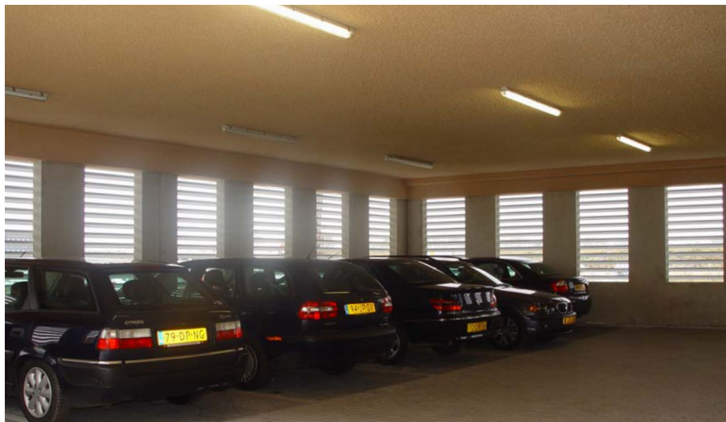
RESIDENTIAL COVERED PARKING - NIEUWEGEIN, UTRECHT, THE NETHERLANDS | SonaSpray "fc" Custom Color Beige | 4,800 sf - .50" Thick