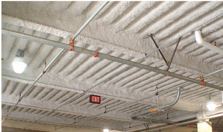
WELLESLEY FREE LIBRARY - WELLESLEY, MASSACHUSETTS | K-13 Light Gray | 32,000 sf - 3" Thick