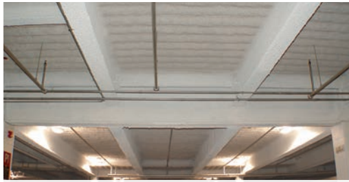
BOSTON UNIVERSITY ARENA - BOSTON, MASSACHUSETTS, USA K-13 Light Gray | 190,900 sf - 3.4" Thick