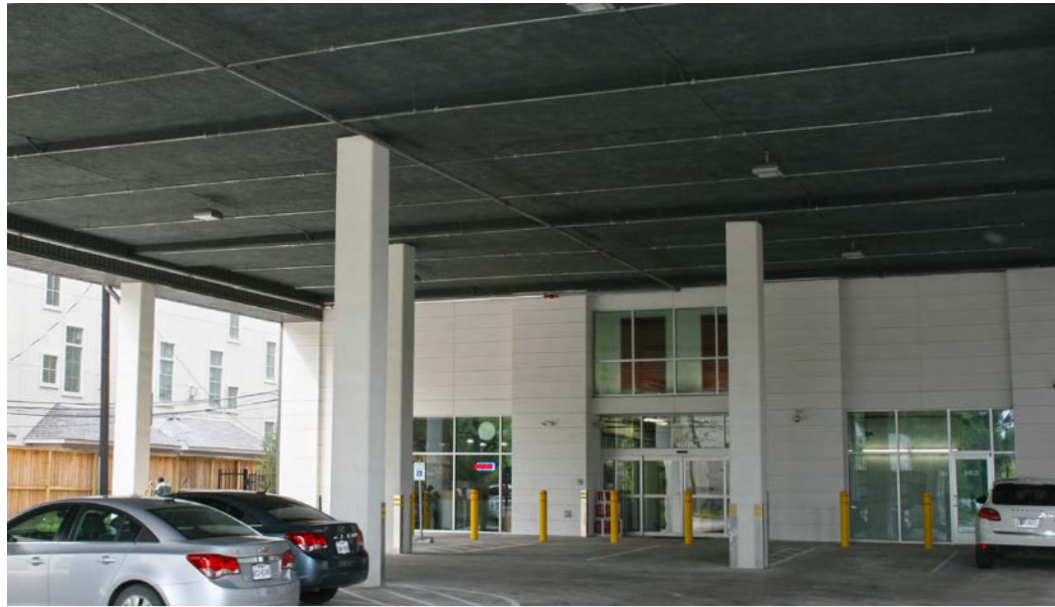
BIG TEX STORAGE - HOUSTON, TEXAS, USA | K-13 Gray | 3,500 sf - 1.5" Thick