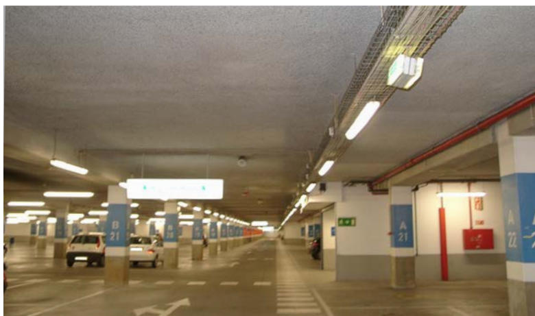
FEIRA NOVA SUPERMARKET - SANTA MARIA da FEIRA, PORTUGAL | K-13 Light Gray | 107,640 sf - .63" Thick