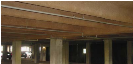
BOY SCOUTS OF AMERICA - SPRINGVILLE, MASSACHUSETTS, USA K-13 Tan | 25,000 sf - 3" Thick