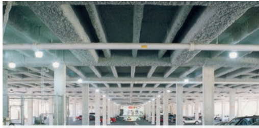
AMC DEERBROOK - HUMBLE, TEXAS, USA K-13 Light Gray | 90,000 sf - 2" Thick