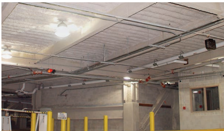
BLUE CROSS AND BLUE SHIELD - CAMBRIDGE, MASSACHUSETTS, USA | K-13 Light Gray | 42,960 sf - 4.04" Thick

For parking structures, insulation is key to limiting thermal transfer from the adjoined interior spaces. K-13's monolithic coating provides an R-Value of 3.75 per nominal inch and can be sprayed up to 4" without mechanical support. For projects requiring additional thermal performance, the K-13 High-R system meets specifications calling for R-Values greater than R-19.