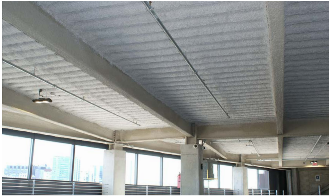
EDUCATION FIRST - CAMBRIDGE, MASSACHUSETTS | K-13 Light Gray | 16,000 sf - 2" Thick