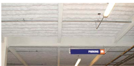
BASKETBALL HALL OF FAME - SPRINGVILLE, MASSACHUSETTS, USA K-13 Light Gray | 75,000 sf - 3" Thick