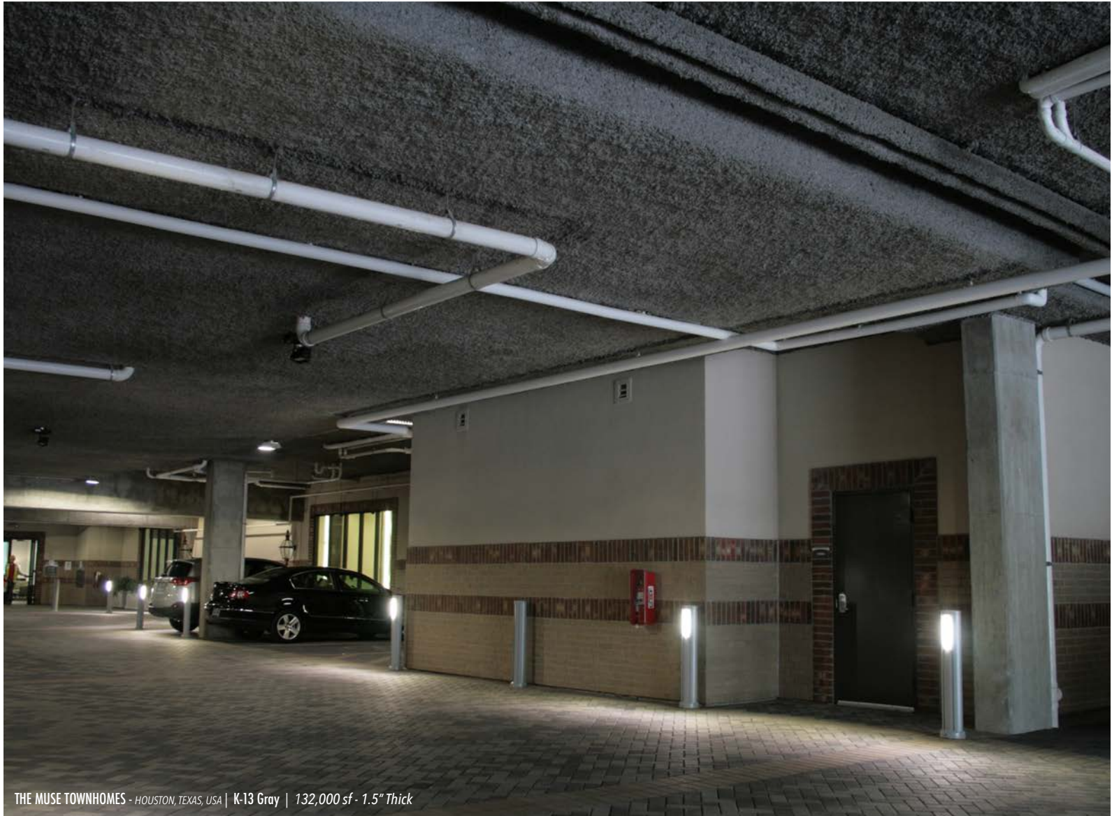
THE MUSE TOWNHOMES - HOUSTON, TEXAS, USA | K-13 Gray | 132,000 sf - 1.5" Thick