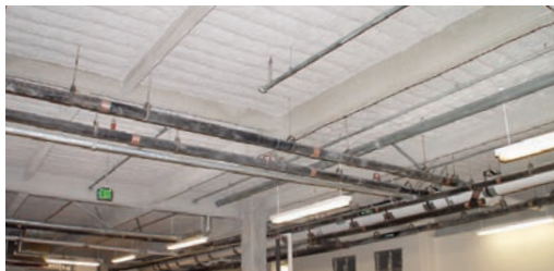
FAN PIER - BOSTON, MASSACHUSETTS, USA K-13 Light Gray | 37,800 sf - 4.04" Thick